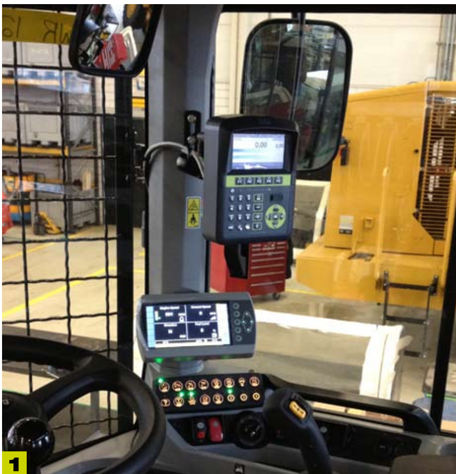
1 On-board instrumentation millennium5