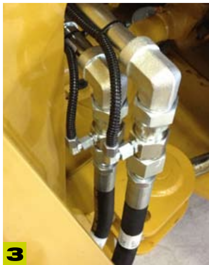
Contactless weighing zone sensor for weight reading.